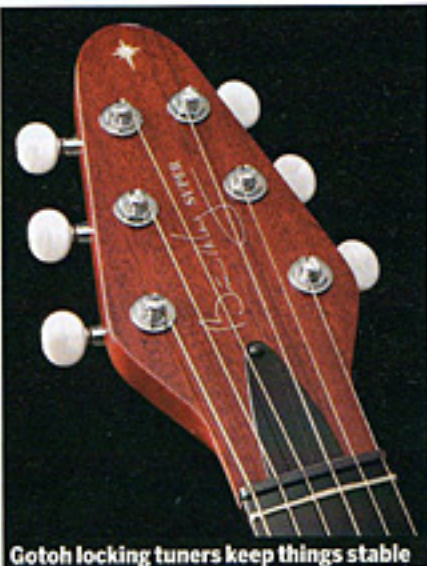
Gotoh locking tuners keep things stable

although it shouldn't be quite so comfortable on paper, it's truly wonderful to play. With a nut width of just over 45mm, a zero fret and a familiar old Fender-type 184mm radius, the benefits to overall tone of necks of this size shouldn't be underestimated.